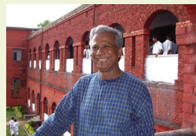
Muhammad Yunus ECONOMIST (Foreign Student from Bangladesh, 1965-66)