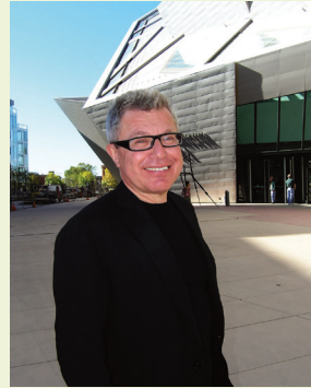
Daniel Libeskind ARCHITECT (U.S. Scholar to Finland, 1984-1985)