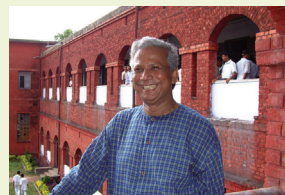
Muhammad Yunus ECONOMIST (Foreign Student from Bangladesh, 1965-66)